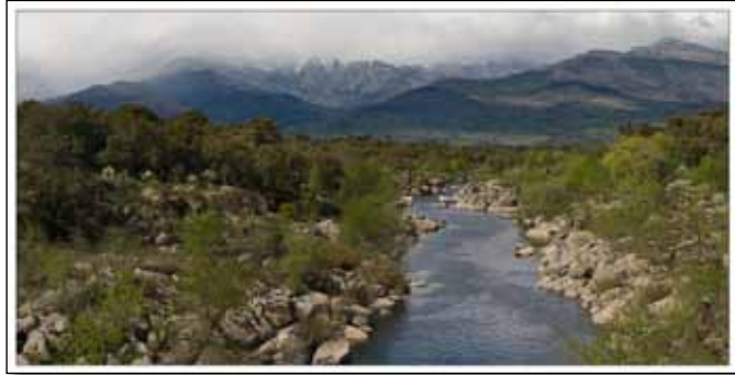
Sierra de Gredos

The Community of Castilla - León borders with the Principality of Asturias and Cantabria to the north, La Rioja and Aragón to the east, Madrid and Castilla-La Mancha to the south and Extremadura, Galicia and Portugal